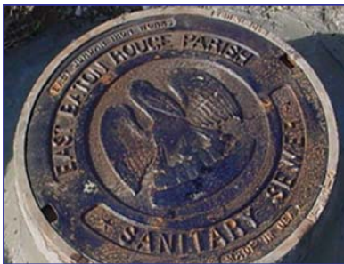
One of the first steps in rehabilitation includes a physical inspection of manholes and pipes to identify blockages.

Rehabilitation of the sewer collection system is a comprehensive physical process that begins with cleaning and inspection of sewer pipes and manholes. Typical rehabilitation repairs include pipe and manhole replacement and trenchless technologies that minimize above ground disturbances such as cured-in-place pipe liners.