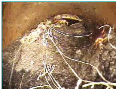
Simply cleaning the pipes and manholes in preparation for the physical inspection removes blockages, debris and roots.